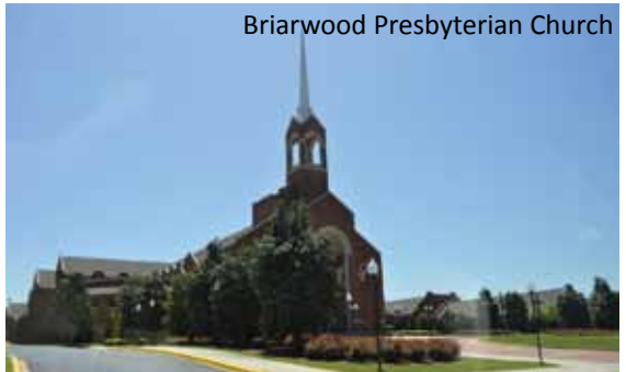
Briarwood Presbyterian Church