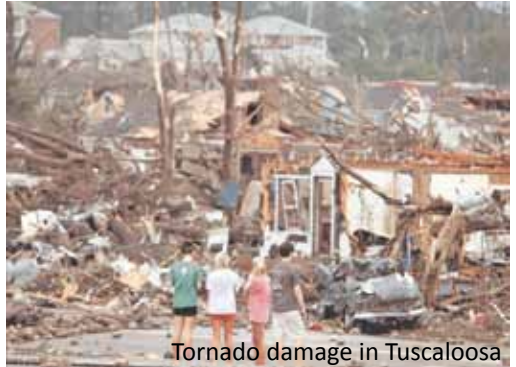
Tornado damage in Tuscaloosa