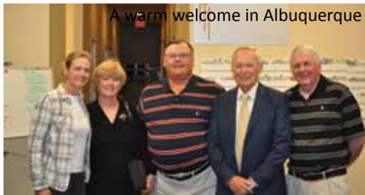
A warm welcome in Albuquerque

Roughly half the people in New Mexico live in the Albuquerque area,