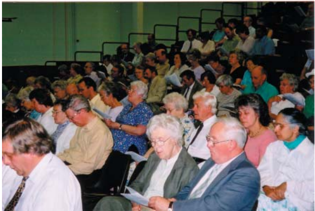
Encouraging numbers at the Donington Convention

The third convention has the longest history of the three. For fifty-seven years Christians in Longhorsley, a village north of Newcastle, has held an annual convention under canvas. It all began when an evangelist from Yorkshire visited the village. His preaching had such a remarkable impact that it spawned an annual gathering for Bible ministry and the