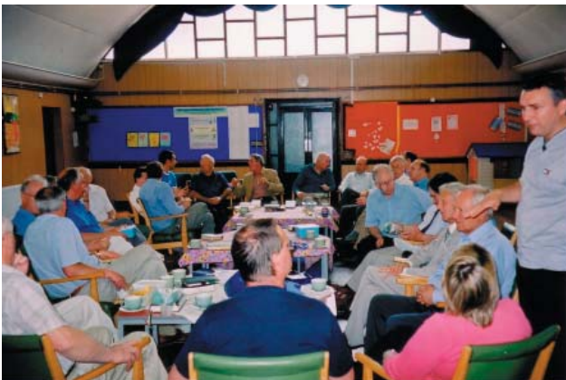
Thinking things through: Church Leaders Conference

As well as the main conference services, there was an excellent meeting for church leaders and a well-attended event for ladies, as well as two fine Sunday services in