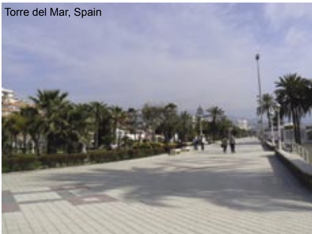
Torre del Mar, Spain

We were just off the Costa del Sol, an annual playground for millions, yet we discovered that it was a spiritual desert, with scattered, mainly small, groups of evangelicals trying to maintain a biblical witness. A relatively short flight from England, Spain is yet another mission field on our doorstep.