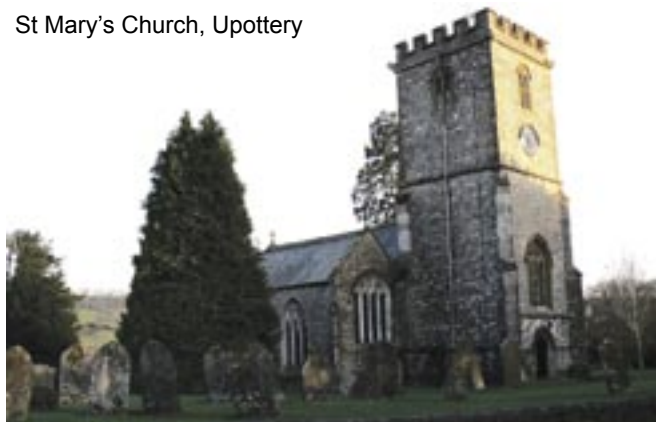
St Mary's Church, Upottery

Right with God in his personal evangelism while studying at Oxford University and knew of a fellow student who had subsequently come to faith.