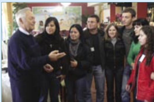
With students in Vlora