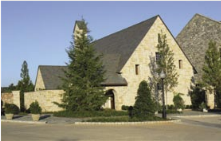
Founder's Hall, The Reserve