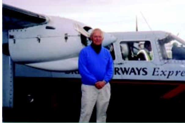
Ready to board!

I already knew, that the people living in these God-blessed islands have the same spiritual needs as those living elsewhere, and the gospel is the only means of meeting them.