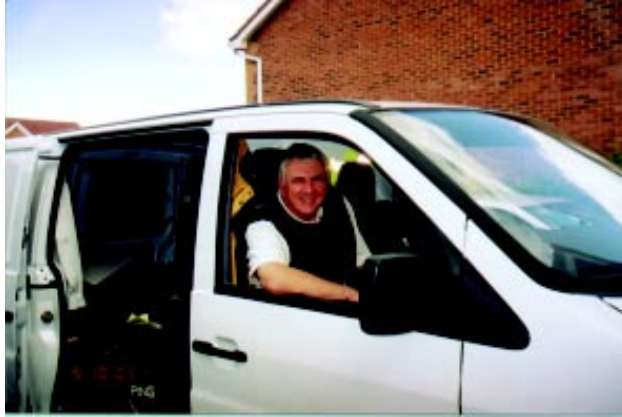
The white van man!

insists on doing all the driving and handles nearly all of the practical arrangements on site. In particular, he takes complete charge of the materials that play a significant part in extending the ministry far beyond the meetings themselves — and woe betide me if I try to get involved!